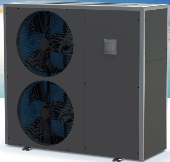
MASTER INVERTER XL Tri

The exclusive intelligent system integrated into Master-Inverter heat pumps regulates the output in relation to the water temperature but also takes into consideration the outside air temperature. This guarantees heating performance at the best COP* level and lowest noise level.