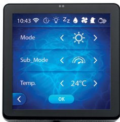
Access the 3 intuitive operating modes in a single gesture!

Intuitive navigation for an ease of operation, settings and all information are simultaneously viewed.