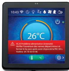
Alarm messages, diagnostics and problem resolutions, hotline contact