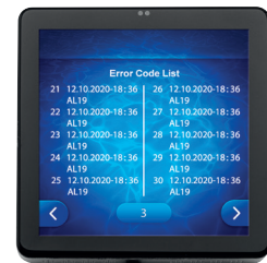
Access to the last 50 log-book events